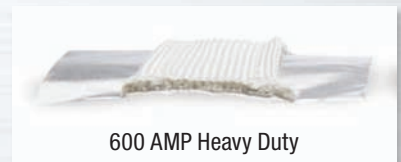
600 AMP Heavy Duty