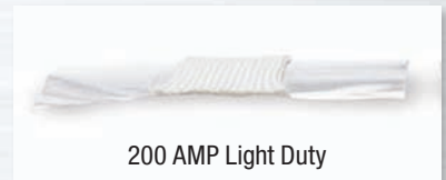
200 AMP Light Duty